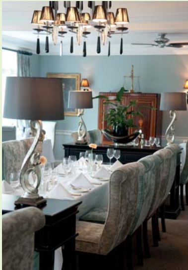
The Gallery Restaurant