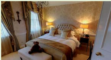
The Redesdale Suite