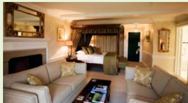
A four poster room