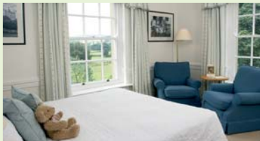
A standard bedroom

For reservations call 01246 582311, www.cavendish-hotel.net